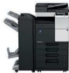
Model shown is 367 with options.

13025 - 156 Street Edmonton, Alberta T5V 0A2 Phone: 780-490-5600 Fax: 780-490-7727 www.cbsca.com